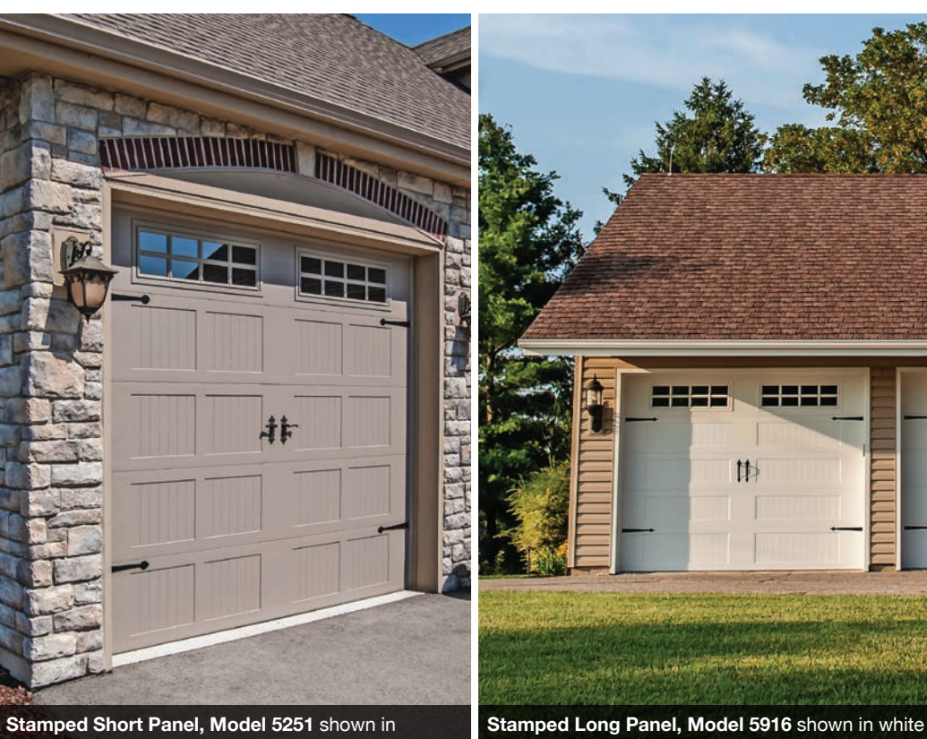
sandstone with optional plain glass, stockton window inserts and wrought iron hardware.

with optional plain glass, stockton window inserts and spade hardware.